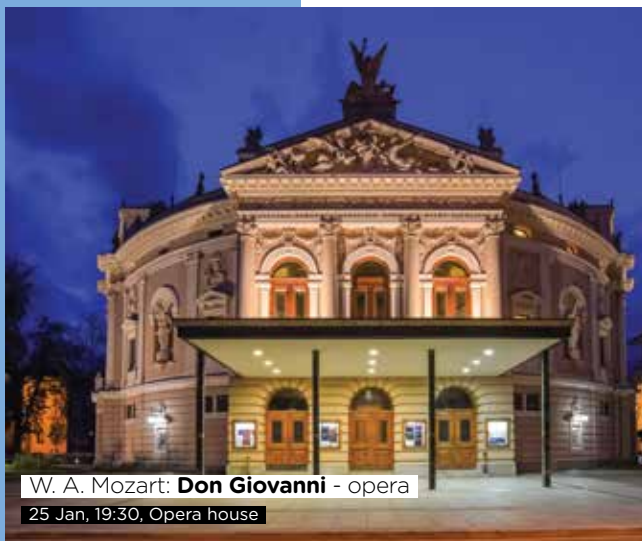
W. A. Mozart: Don Giovanni - opera 25 Jan, 19:30, Opera house