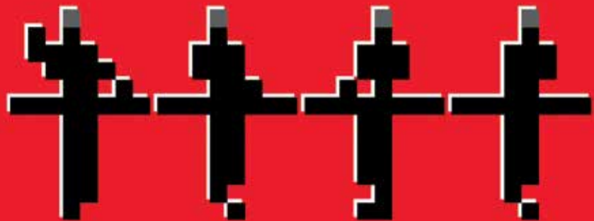
Kraftwerk (Germany) - electro 22 Feb, 20:00, Tivoli sports hall

The legendary electronic music group Kraftwerk will perform in Ljubljana with their new stunning 3-D concert show. German innovators and pioneers of electronic music are considered to be one of the most important groups in music history. After their first concert in Slovenia in 2004, when they were celebrating the 30th anniversary of their breakthrough Autobahn album, Kraftwerk now return with a spectacular 3-D show and a Programme that covers their entire musical opus.