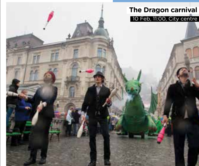
The Dragon carnival 10 Feb, 11:00, City centre

The Dragon carnival traditionally held in Ljubljana consists of a large Shrovetide carnival parade through the city's streets and a programme of entertainment held in the centrally located Kongresni trg square. The carnival parade includes, among others, a number of typical Slovenian carnival figures rooted in pagan tradition, such as "kurent", "laufar", "morostar" and several others. The theme of the Dragon Carnival 2018 is The European Year of Cultural Heritage and the 70th anniversary of Ljubljana Puppet Theatre.