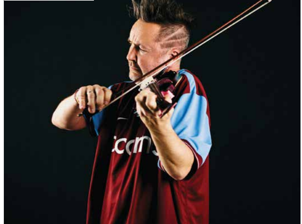
Nigel Kennedy (England)